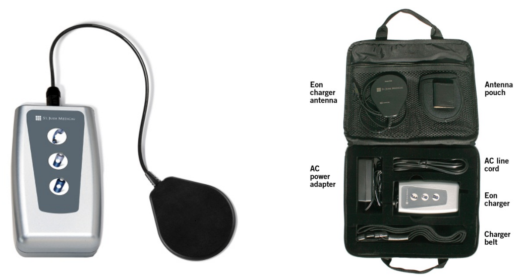
Diagram 3. New Eon<sup>TM</sup> Charging System Model 3726

The new Eon<sup>TM</sup> Portable Charger Model 3726 will be provided with instructions. These instructions are especially important for current users of the Eon<sup>TM</sup> Wall Charger Model 3701 to follow because the process for charging your device is slightly different. Specifically, the new portable charger has rechargeable batteries that must be recharged by plugging the portable charger into a wall outlet before you can use the portable charger to charge your Eon<sup>TM</sup> spinal cord stimulator. Please refer to the new Eon<sup>TM</sup> Portable Charger Model 3726 manual for instructions on charging the charger prior to charging your spinal cord stimulator. The replacement Eon<sup>TM</sup> Portable Charger Model 3726 is shown in Diagram 3. Note that the new charging antenna has also been redesigned and is now solid like your patient programmer antenna and does not contain an opening like your old antenna shown in Diagram 2.