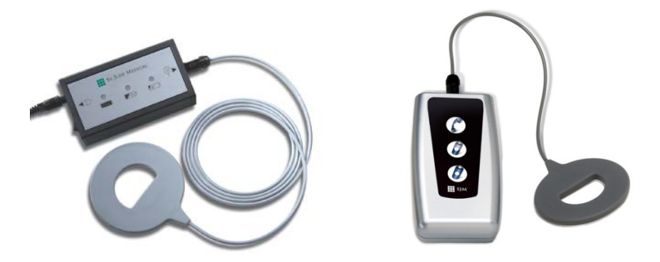
Diagram 2. Old Eon<sup>TM</sup> Chargers and Charging Antennas, Model 3701 and Model 3711

When you call to initiate the exchange, the St. Jude Medical representative will coordinate the shipment of a new Eon<sup>TM</sup> Charging System, Model 3726 at no charge to you. The new charging system includes the charger, charging antenna, accessories and carrying case. The components from the old charging system are not compatible with the new Model 3726 charging system and are to be returned to St. Jude Medical. In addition to your new charging system, the delivery will also include a pre-paid return mailer to return your old charger(s) and antenna(s). The St. Jude Medical representative will explain the return process during your call.