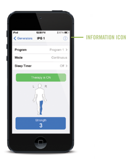
ST. JUDE MEDICAL™ PATIENT CONTROLLER

*These features do not completely eliminate the possibility of the neurostimulator being affected during surgery or MRI scans.